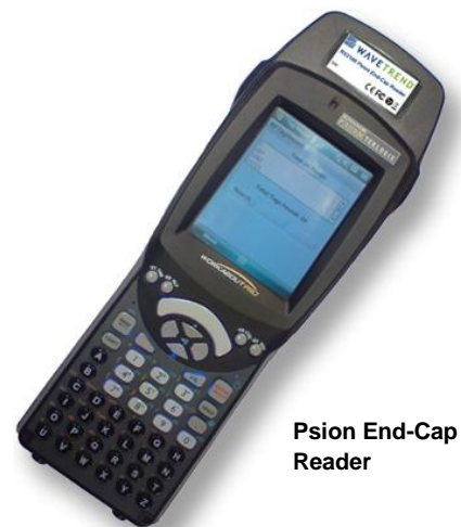
Psion End-Cap Reader

Users can combine their choice of barcode scanners, imagers, wireless LAN & WAN adaptors, GPS positioning and GSM/GPRS/EDGE communication modules together with the active RFID reader.